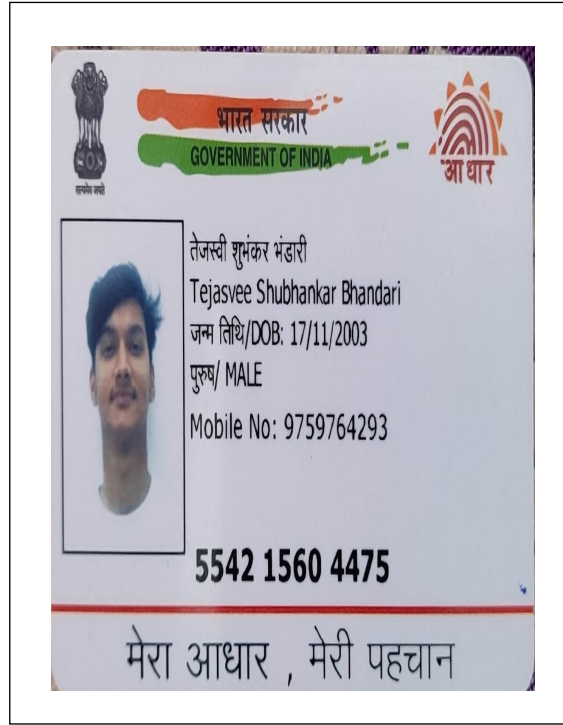
Candidate's ID Proof